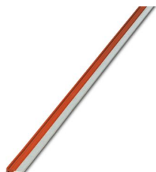
Continuous plug-in bridge, nominal current: 32 A, length: 500 mm, color: red

Please be informed that the data shown in this PDF document is generated from our online catalog. Please find the complete data in the user documentation. Our general terms of use for downloads are valid.